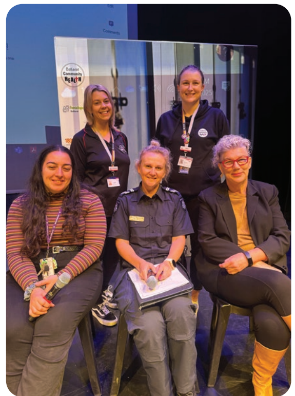
The Expect Respect program

Part of a whole-of-school approach, Expect Respect also provides schools with policy support, professional learning, and clear referral pathways. By equipping young people with knowledge and confidence, the program fosters a safer and more respectful community.