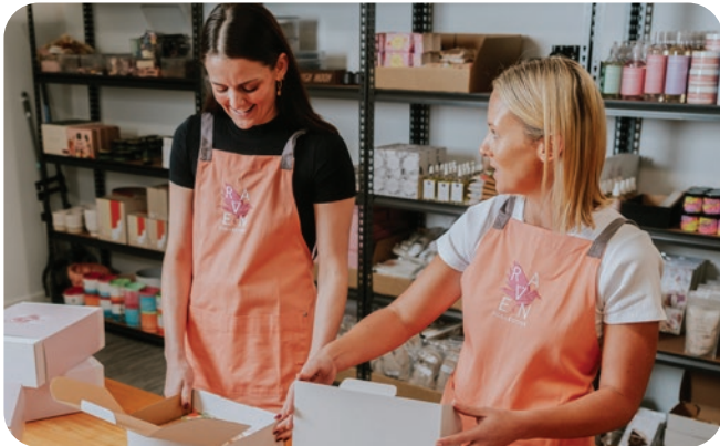
Raven Collective supports women who have experience family violence with work opportunities and skill development.