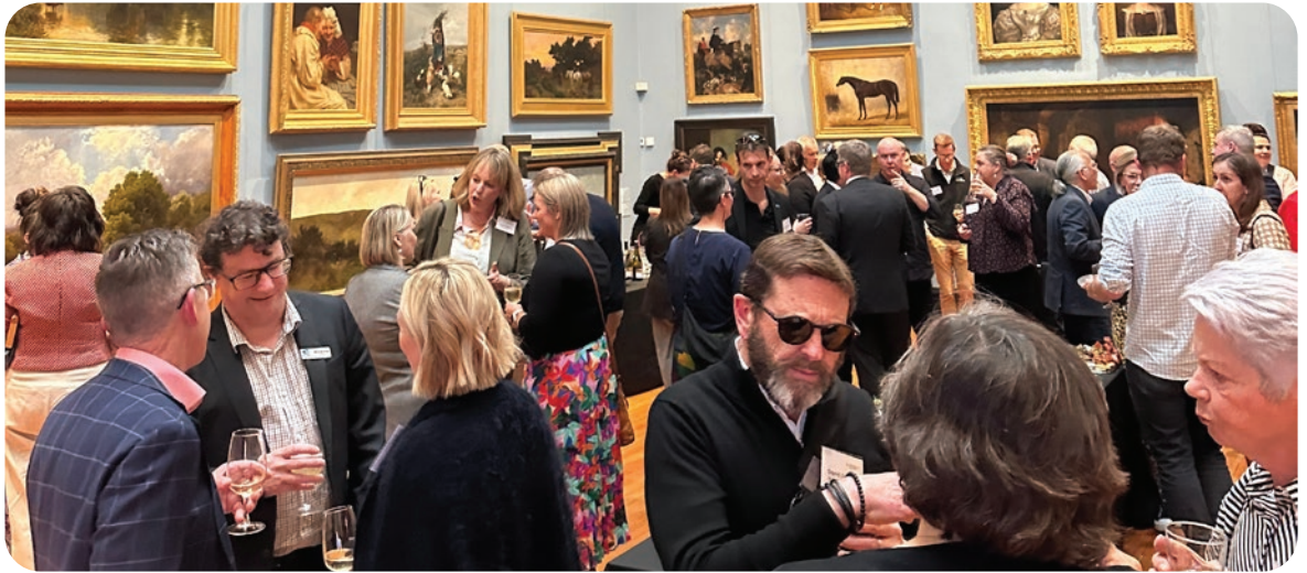
The Ballarat Foundation partnered with the Committee for Ballarat to launch the Future Shapers Fund in October.