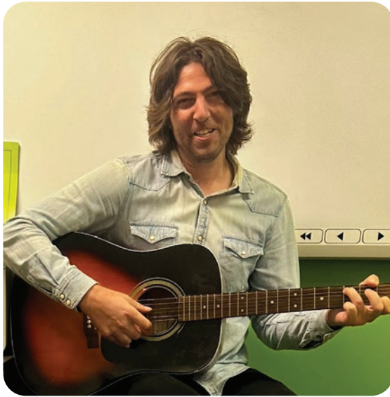
Berry Street's Goldfields Education program uses tailored techniques to engage young people in education.