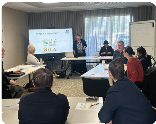
Volunteering Ballarat hosted a “breaking down barriers” session in October.

To support the VCN, the Ballarat Foundation hosted a Volunteer Expo at St Patrick's Hall, attracting nearly 200 community members. Additionally, the Foundation publishes a Volunteer Handbook on its website, providing a comprehensive guide to volunteering opportunities for the community.